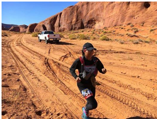
Running on the Arches Loop

COURSE – The routes of all races are very scenic and challenging. Please study the course map and “MV Ultra Course Guide” to get a feel for the course. It is important that you know the routes prior to the race and develop your energy and hydration plan.