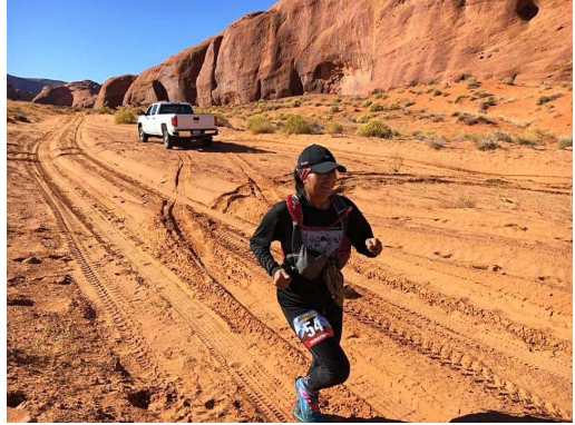
The view from Mitchell Mesa