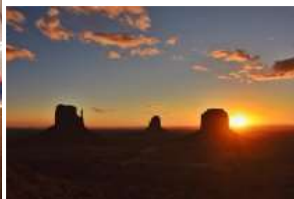
Race morning near the start line

COURSE – The routes of all races are very scenic and challenging. Please study the course map and “MV Ultra Course Guide” to get a feel for the course. It is important that you know the routes prior to the race and develop your energy and hydration plan.