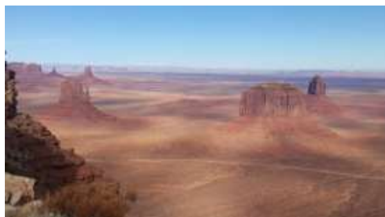
The view from Mitchell Mesa

RACES – The 50-mile race is capped at 50 runners, while the 50K race is capped at 150 runners. Both of these races are challenging routes, with the majority of miles on singletrack trail, dirt roads and a few miles on the Valley Drive. The 50-mile starts at 7:00 a.m. (cut-off is 15 hours) and the 50K at 7:15 (cut-off is 12 hours). You may need a headlamp in the final miles of the race. The very scenic Half Marathon Trail Race course near Sentinel Mesa is capped at 250 runners and begins at 9:00 a.m. The route is a very challenging singletrack track course for the majority of the route, with some sandy doubletrack at the end.