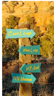
Code Talker Trail