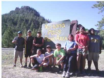
Narbhona Pass Picnic Area

Trails have proven to be a valuable and growing community asset across the Navajo Nation in recent years. They can, as part of a broad approach to health and wellness, make a significant contribution to a more positive future on the Nation. They can also be powerful economic development engines. Finding the balance of trails with natural, environmental and cultural resources is important and feasible for trail planners.