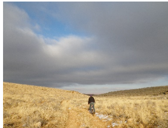
Lower Basin, LCR Tribal Park