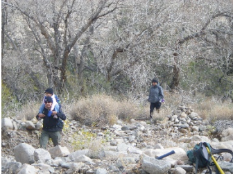
Twin Falls Trail, T'iis Nazbas

across the Nation, including the Chuska Mountain Bike Route, Window Rock Trail System, Rainbow Trail and LCR Trail.