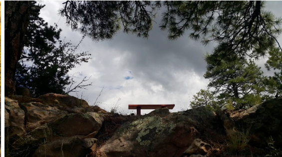
Camp Asaayi Trail