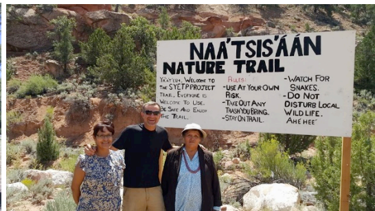
Naatsisaan Nature Trail, Navajo Mountain

The Task Force hosts an annual Navajo Nation Trails Conference, and has periodic meetings across the Nation. The overarching mission of the Task Force is to support and promote trails efforts in communities and tribal parks across the Navajo Nation.