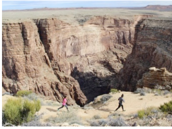
Little Colorado River Gorge Tribal Park