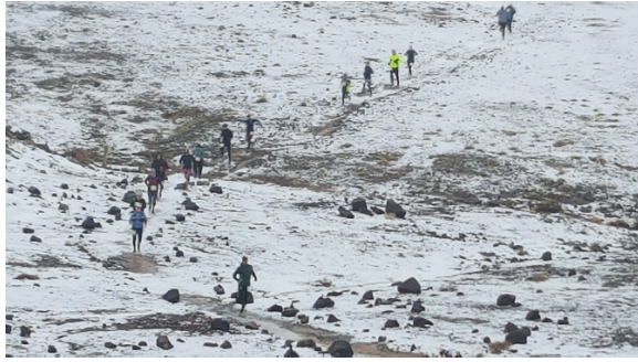
Wintry paradise on Dancing Horse Trail at Four Corners Monument