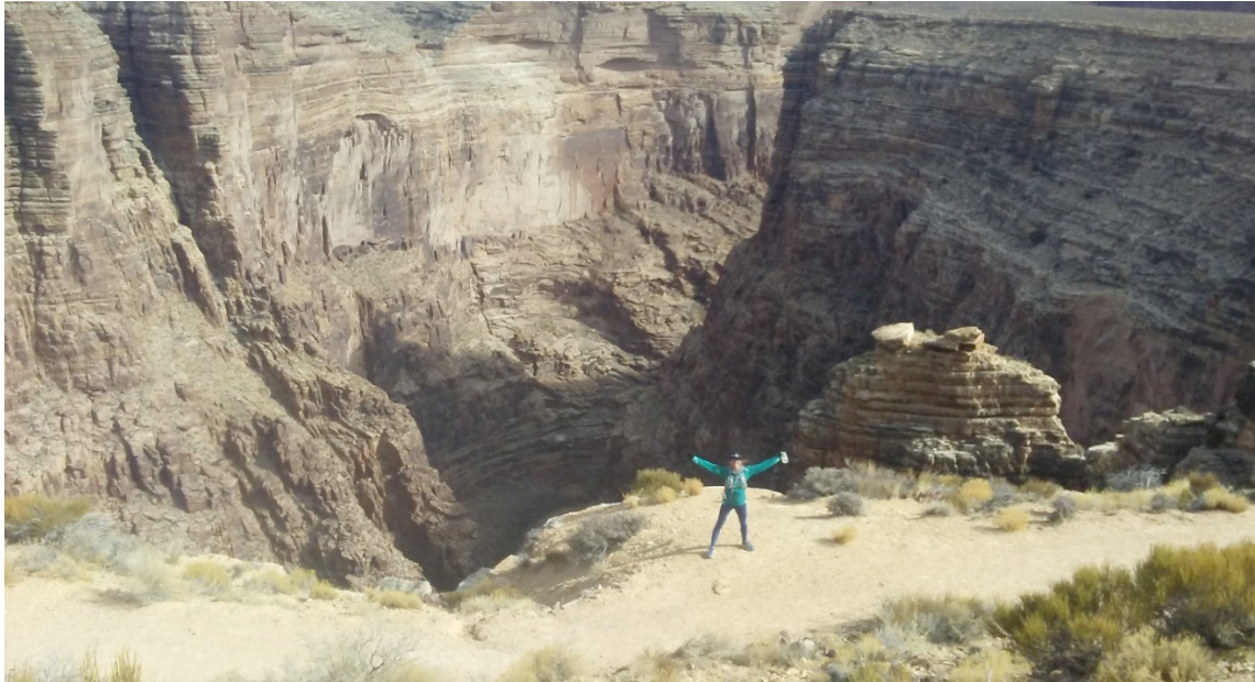
A runner pauses along the LCR Rim Trail during the LCR Half Marathon, held each February in the park

the rim trails are modestly maintained and accessible, the canyon routes are extremely remote, minimally-travelled and are considered suitable – and very rewarding – for experienced hikers.