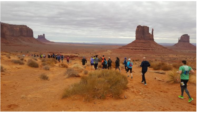
The MV Ultra and the Navajo Parks Race Series are co-sponsored by the nonprofit organization NavajoYES and Navajo Parks & Recreation, with support from Goulding's Lodge, The View Hotel, Utah Navajo Health System, the Navajo Rangers, MV Fire, Utah State University and Navajo EMS.